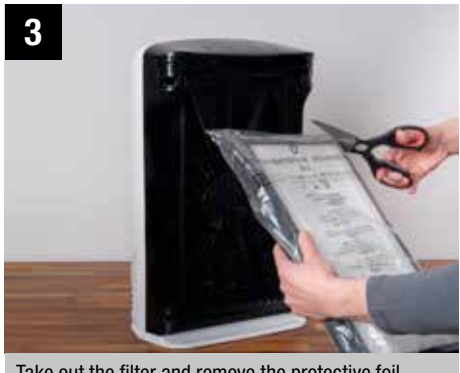
Take out the filter and remove the protective foil.