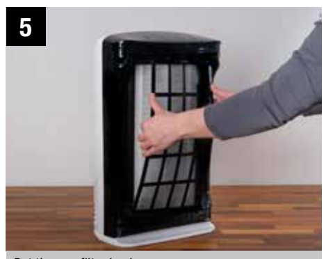
Put the pre-filter back on.