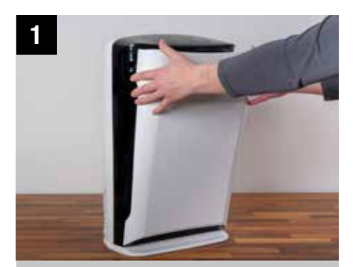
Remove the magnetically fixed front cover.