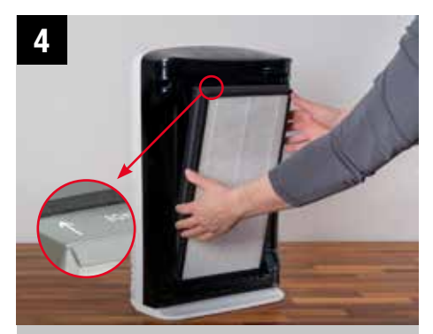
Insert the filter back into the holder (note the markings).