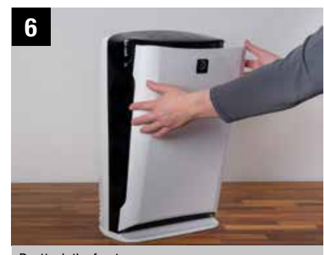
Reattach the front cover.