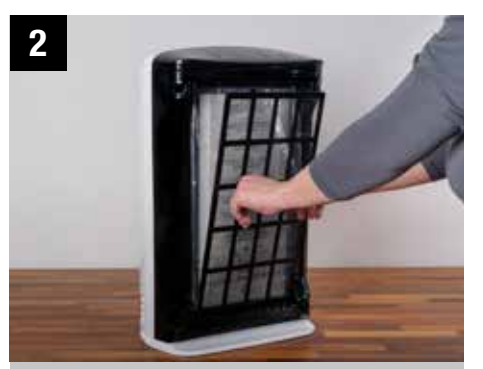
Take off the pre-filter.